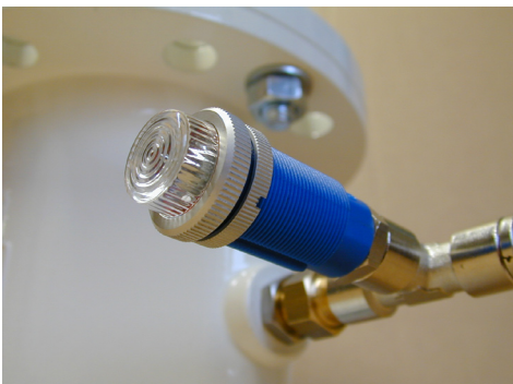
pinch valve no pressure (open)

This unit is suited for monitoring and indicating operating conditions of AKO pinch valves. When the control pressure exceeds 1,5 bar to close the pinch valve, the visual pressure indicator will ① activate. When activated, a red signal will turn on (easily seen).