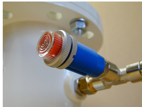
pinch valve under pressure (closed)